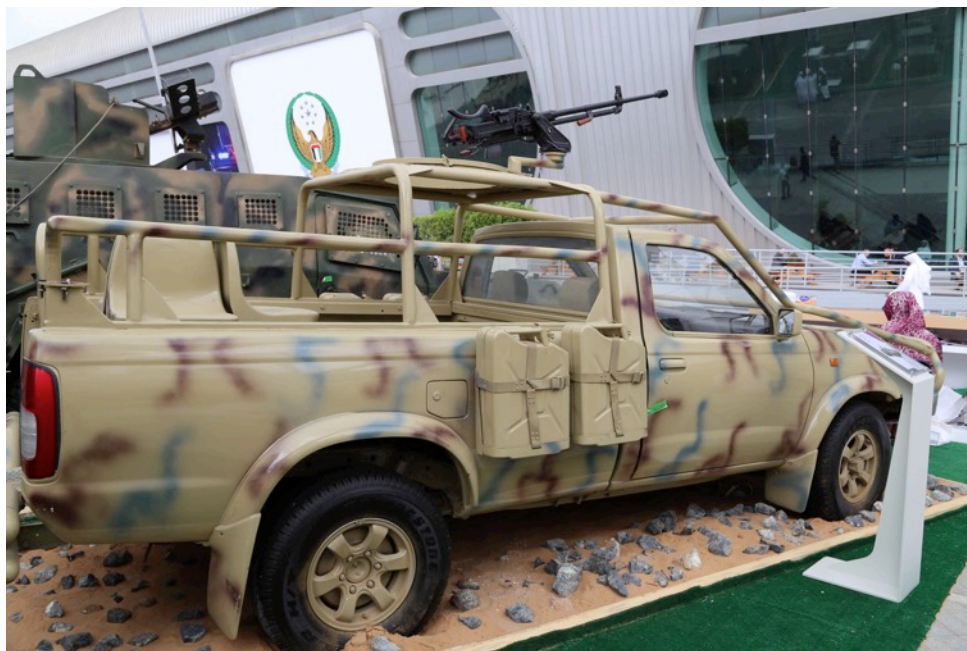
The ‘Tamal Tactical Vehicle’ is mounted with a Khawad 12.7 x 108 mm heavy machine gun. It is a modified Ruiqi Series diesel 4x4 pickup, which is produced by Zhengzhou Nissan, a subsidiary of China’s Dongfeng Motor Corporation.