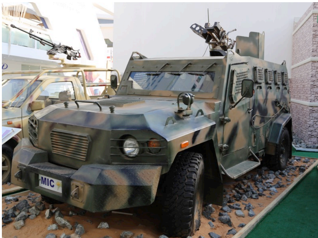
The ‘Sarsar-2’ armoured reconnaissance vehicle is based on a modified 1.2 ton South Korean KIA chassis, but fitted with armour capable of withstanding small arms fire. The vehicle is mounted with a ‘Multi Mount Pintle 0.50” MK 19/7.62’, which is produced by Nimer Mounts, based in Oman.