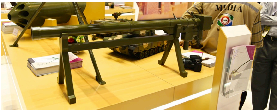
This miniature model man-portable air defence system (MANPADS) appears to be a copy of China’s FN-6. The model did not include a name plaque or brochure. An MIC representative said that the weapon was still under development, and would be ready for service in one to two years.