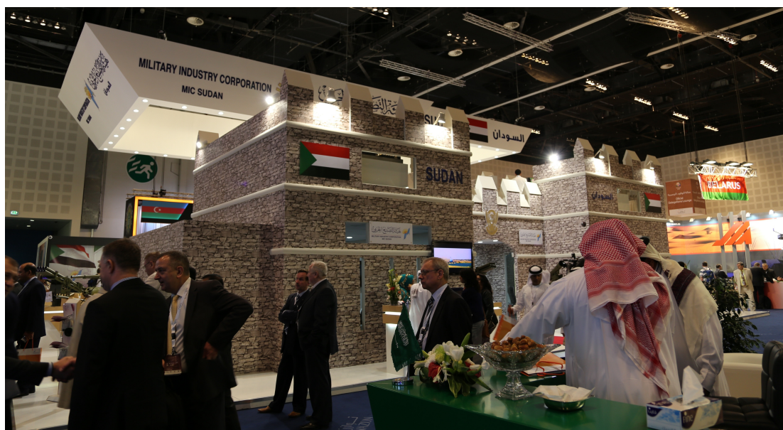
MIC display at the 2015 IDEX conference.

MIC displayed a wide range of weapons and military equipment, including small arms, light weapons and their ammunition, six military vehicles, two naval boats, communication and optical equipment, and an electronic firing range simulator. Consistent with models displayed in 2013, the majority of MIC's products were copies or close derivatives of foreign-manufactured items. Most of the weapons and ammunition reflected Chinese and Iranian design, while the military vehicles were modifications of Russian and South Korean vehicles. Bulgaria designs date from expired licensing deals from the late 1990s. The MIC displayed real samples, miniature models, as well as product brochures. This HSBA Arms and Ammunition Tracing Desk report reviews the physical samples on display.