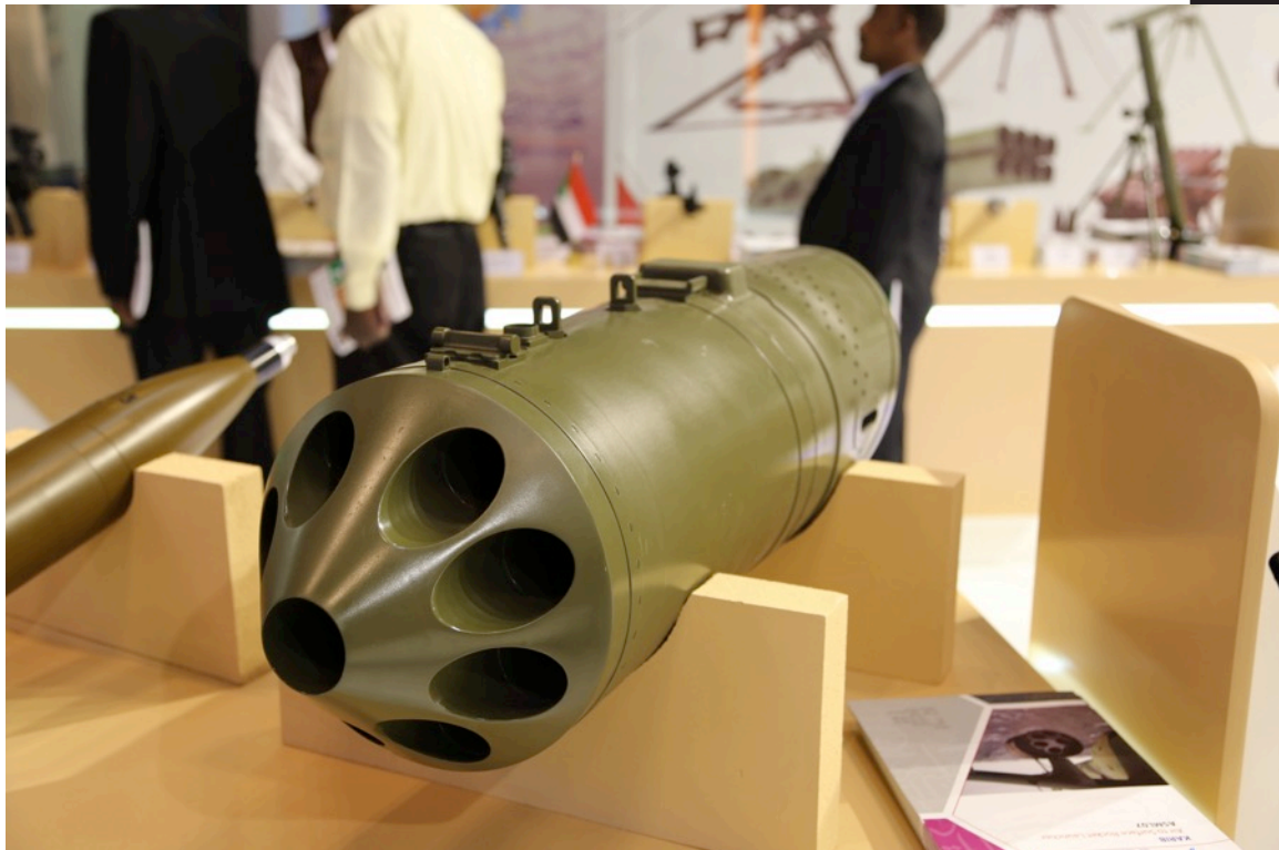
The ‘Karib Air to Surface Rocket Launcher’ is designed for air-to-surface helicopter fire. It is not clear whether Sudan has employed this weapon during its bombing campaigns in Darfur, South Kordofan, and Blue Nile.