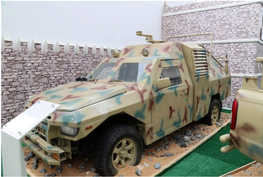
The ‘Nimr Long-Range Patrol Vehicle’ is based on a Chinese Dongfeng Motor Corporation 4x4.