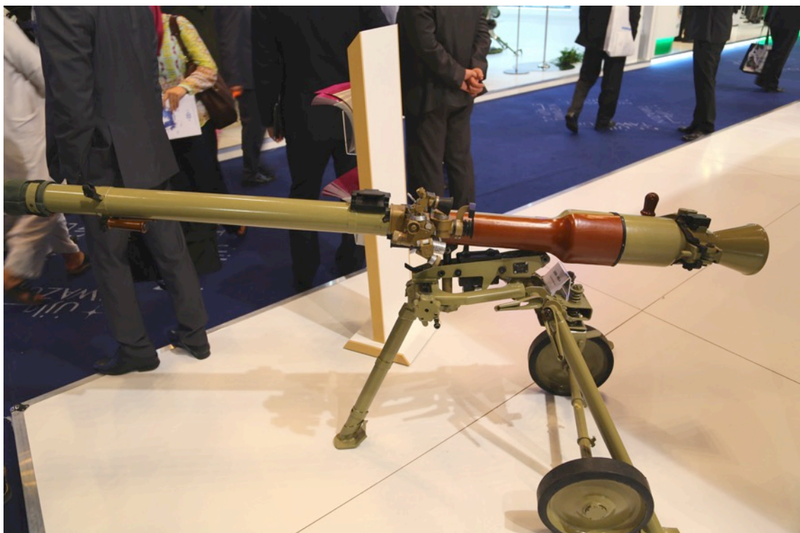
The 'Soba SPG-9 73 mm Anti-tank Gun' is similar in construction to the Bulgarian and Iranian models. The Small Arms Survey has yet to encounter this weapon in the field.