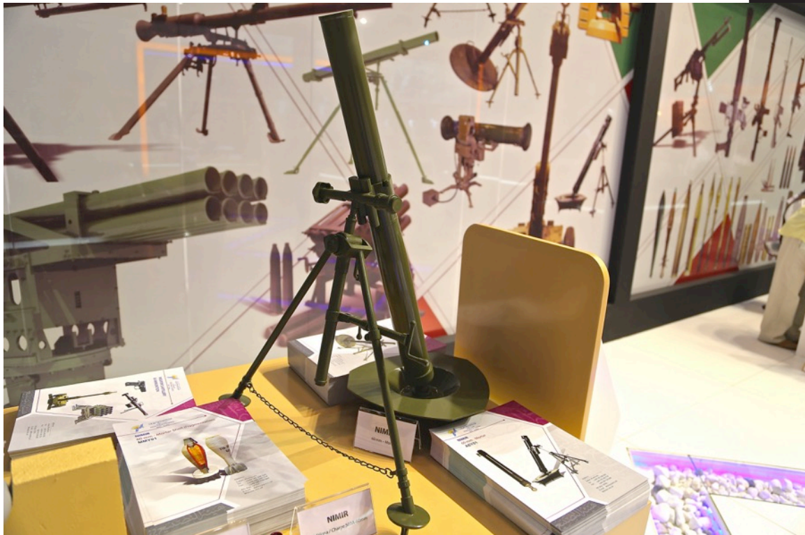
'Nimir 60 mm Mortar'. The Small Arms Survey documented this weapon among weapons that the SSDF handed over to the SPLA in May 2012 in Jonglei.