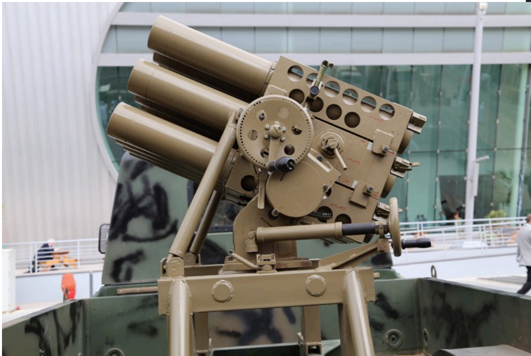
The 'Taka Multi Rocket Launcher System' is a close derivative of the Iranian manufactured 107 mm multi rocket launcher. The Small Arms Survey documented this launcher among weapons with the South Sudan Liberation Movement/Army (SSLA) in Unity after accepting amnesty in April 2013. Investigators have also documented this weapon in Cote d'Ivoire and Somalia.