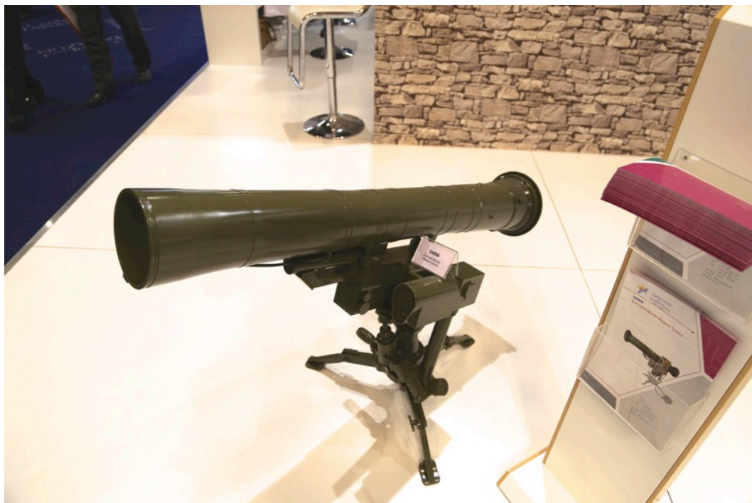
The 'Sarib Anti-tank Missile Weapon System' closely resembles the Chinese-produced HJ-8 optically-tracked wire guided missile system. The Small Arms Survey documented HJ-8s that the SPLM-N captured from SAF in South Kordofan, Sudan in December 2012, but has not encountered the Sudanese version.