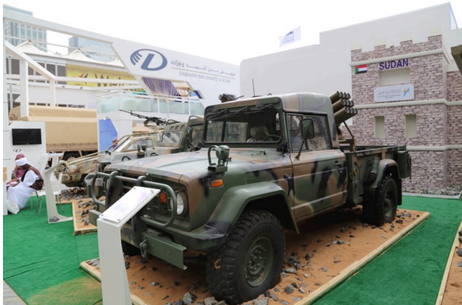
The ‘Taka Multi Rocket Launcher System Carrier’ has a 107 mm multi-rocket launcher mounted in its rear cab. The truck is a modified South Korean produced KIA 4x4, which, according to the vehicle identification number (VIN) plate, was delivered in 2012.